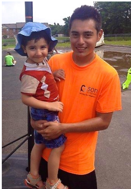
New Best Buddies

I call and go to her apartment to bring her to English class. She is standing in her open door waiting for me. Her daughter is smiling and with total trust climbs into my car. Her son follows. “Thank you” she says with a tear streaming down her face.