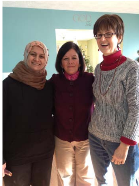
Honoring a Selfless Servant